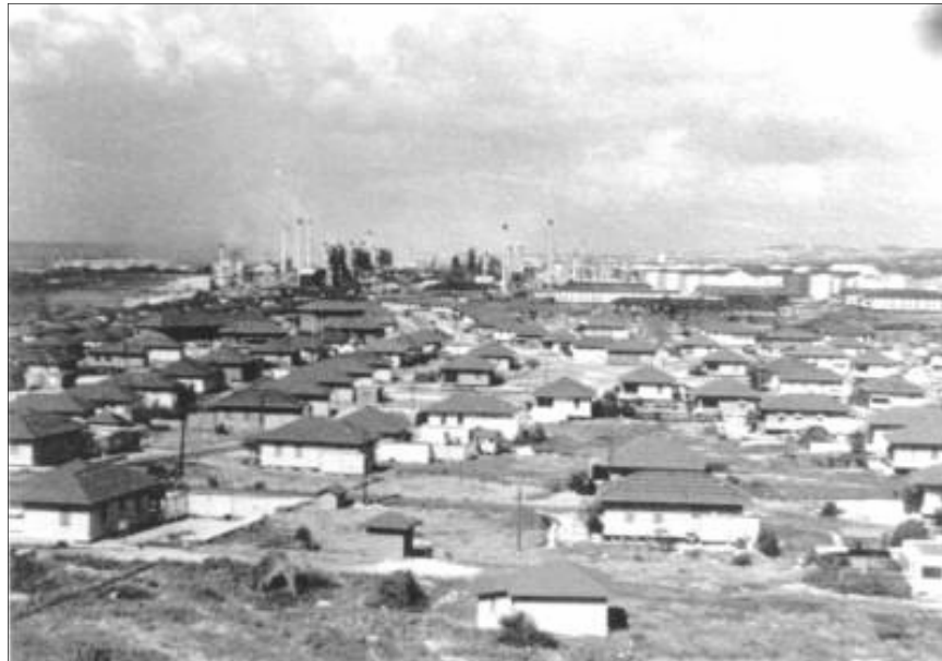
Aerial view of company concession - - - Circa 1940's

Memories of my days in Aruba and the wonderful friendships are treasured. Now I feel truly blessed with good health, wonderful friends and the opportunity to help others.